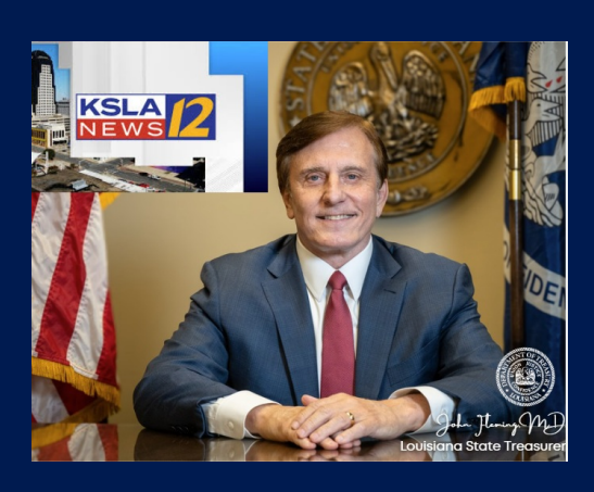
KSLA 12 INTERVIEW